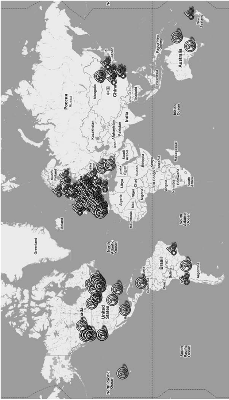
Figure 1. Bike-Sharing World Map