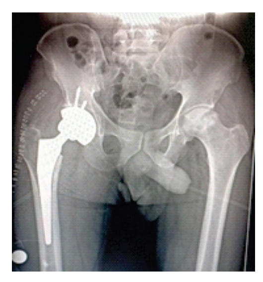
Figure 5. Post operative-ray of the pelvis and both hips - AP view

methylprednisolone 80 mg/day for a week while in the hospital. He started experiencing right hip joint pain six months later. A nearby physician treated him with analgesics for eight months. He later developed both hip joint pain and stiffness as a result. Magnetic Resonance Imaging (MRI) revealed both femoral heads to have AVN. He underwent an uncemented total hip arthroplasty (Figure 4 and 5).