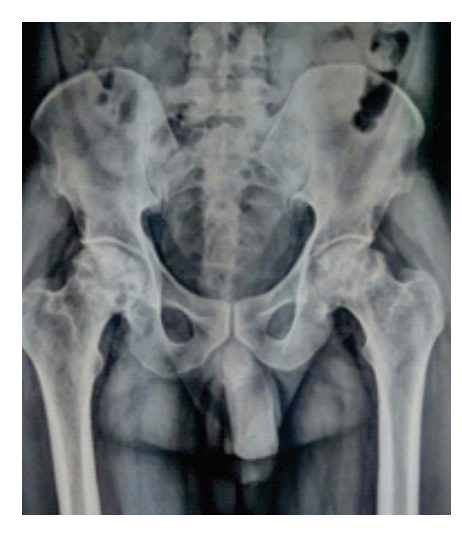
Figure 4. X-ray of pelvis and both hips - AP view

On June 24, 2021, a male patient, 32 years old, was diagnosed with COVID-19 and was thereafter admitted to the hospital. He received intravenous (IV)