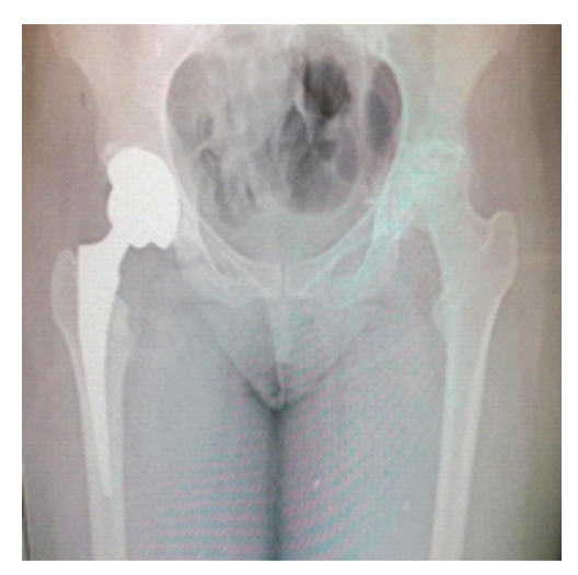
Figure 3. Post-operative x-ray of the pelvis and both hips - AP view