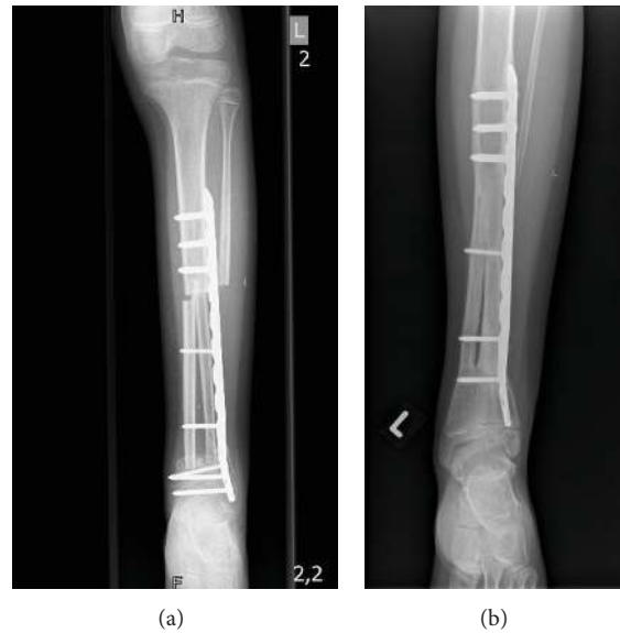
FIGURE 1: (Patient no. 7) (a) Radiograph of a 9-year-old girl with Ewing's sarcoma of the distal tibia diaphysis. Defect reconstruction (12 cm) was achieved by using bilateral fibular graft and plate osteosynthesis. Due to the small remaining distal epiphyseal fragment the screws had to be placed in the epiphysis. (b) Radiographic results 29 months after tumor resection giving good evidence of bony healing. The epiphyseal screws have been removed. Nevertheless the ankle shows a mild valgus deformity resulting in an MSTS score of 93%.