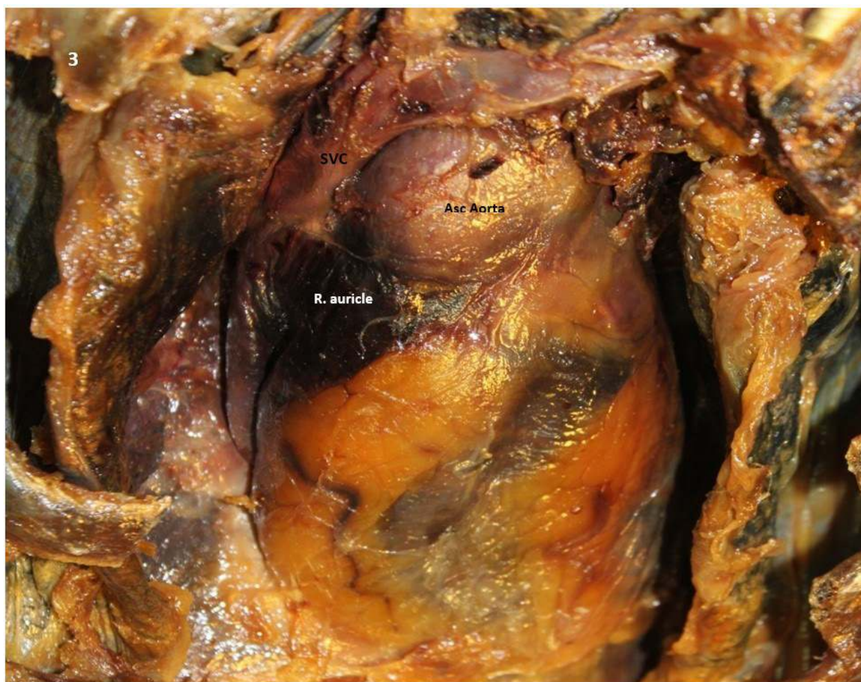
Figure 3. Heart without fibrous pericardium in a vertical position. Superior vena cava (SVC), Right auricle (R auricle), Ascending aorta (Asc Aorta).

Banneheka (2008) in a cadaveric study (106 cadavers) reported in 52% of the cases the phrenic originated from C4 and C5 and only in one case C4 segment was absent.