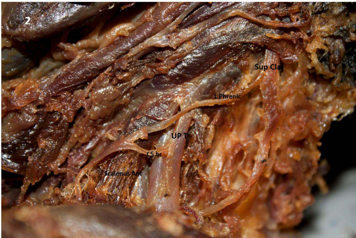
Figure 2. The left phrenic nerve (R phrenic nerve) originates from the supraclavicular nerve (Sup cla) and a branch from C5 (C5 br) root of the upper trunk (UP) of the brachial plexus. The left phrenic nerve descends in front of scalenus anterior (scalenus ant).