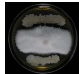
Fusarium oxysporum f. sp. melonis FJAT-9230 b