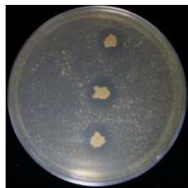
Ralstonia solanacearum FJAT-77 a

To clarify the biocontrol mechanisms of FJAT-46737, we subsequently evaluated the suppressive effects of its cell-free supernatants on tomato bacterial wilt. A preliminary experiment indicated that undiluted cell-free supernatant caused seedling injury while the 2-fold