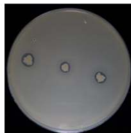
Ralstonia solanacearum FJAT-91 a