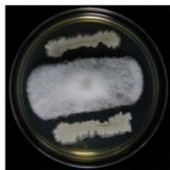
Fusarium oxysporum f. sp. capsicum FJAT-831 b