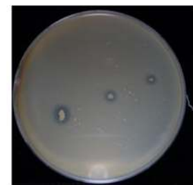
Escherichia coli FJAT-301 a