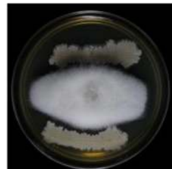
Fusarium oxysporum f. sp. niveum FJAT-30265 b