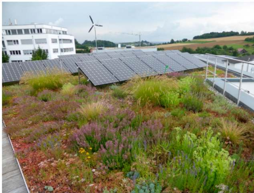
Figure 2. Combinations of vegetation and solar panels on green roofs, such as on this roof by ZinCo, Germany, can increase habitat heterogeneity.