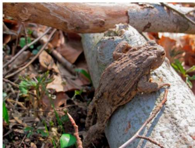
Figure 8. Amphibians can pass natural structures in the surroundings of constructed wetlands much better than surfaces made of concrete or plastic sheets. (Photo: A. Z.).