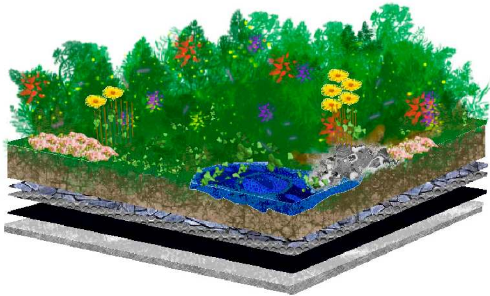
Figure 7. Scheme showing the possible appearance of a biodiverse green roof, based on recommendations by Germany’s Federal Agency for Nature Conservation [81]: A structurally diverse roof with vegetation, substrate, gravel, stones, dead wood, and puddles will provide a range of niches that can be occupied by a range of species. The basic layers that make up a green roof are shown as well with (from bottom to top) the roof itself, gravel as drainage system and substrate..