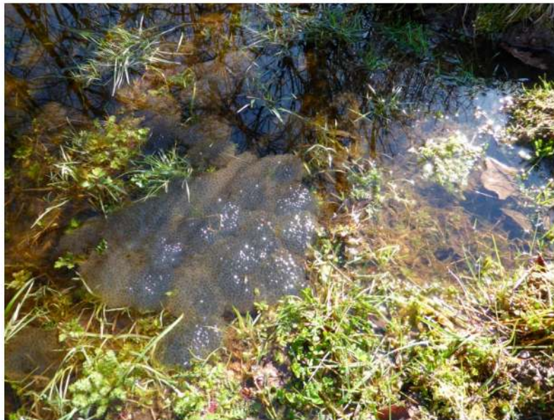
Figure 4. Shallow zones of water within constructed wetlands support spawning amphibians.

surroundings. Integrated constructed wetlands for the treatment of agricultural wastewater in Ireland that consist of a number of connected ponds serve as habitat for a range of organisms, including macroinvertebrates [139]: A total of 134 taxa have been recorded, the most frequent of which were Coleoptera (66 taxa, 49%), Hemiptera (20 taxa, 15%), Diptera (11 taxa, 8%), Gastropoda (11 taxa, 8%), Trichoptera (9 taxa, 7%), and Hirudinea (5 taxa, 4%). Clean ponds (i.e., those last in line) supported a particularly high diversity of macroinvertebrates [139]. Therefore, Becerra-Jurado [140] suggested that the number of ponds should be increased to a minimum of five and that the expanse of water should be increased as well. Holtmann et al. [141] showed that rainwater ponds in urban areas play an important role in the preservation of dragonflies and for endangered species in particular. Regular maintenance and thus high habitat quality of these ponds compensated for the low quality of the surrounding urban landscape (Figure 5).