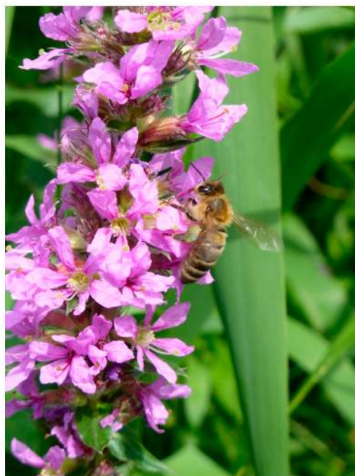
Figure 5. Marsh plants such as Lythrum salicaria provide food resources for insects.