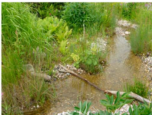
Figure 9. This wetland, which has been integrated into a green roof, supports the presence of plants and animals usually absent from green roofs. (Photo: A. Z.).

Supplementary Materials: The following are available online at http://www.mdpi.com/2071-1050/11/20/5846/s1 , Table S1a: Overview of all 77 articles that were included in the review of the effects of green roofs on biodiversity in urban areas; Table S1b: Overview of articles that were excluded from the review on effects of green roofs on biodiversity in urban areas due to one or several of the following reasons: no focus on green roofs, no focus on effects of green roofs on biodiversity, conceptual article, no access to the article (online or through a direct request to the author). The following are available online at http://www.mdpi.com/2071-1050/11/20/5846/s2 , Table S2a: Overview of all 65 articles that were included in the review of the effects of constructed wetlands on biodiversity in urban areas; Table S2b: Overview of articles that were excluded from the review on effects of constructed wetlands on biodiversity in urban areas due to one or several of the following reasons: no focus on constructed wetlands, no focus on effects of constructed wetlands on biodiversity, conceptual article, no access to the article (online or through a direct request to the author), focus on microorganisms.