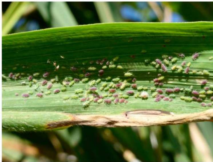
Figure 6. Aphids feeding on Phragmites australis in a constructed wetland.