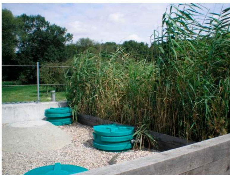
Figure 3. Constructed wetlands usually consist of planted basins where water purification takes place and technical elements such as those seen in the foreground of this photo.

Constructed wetlands (Figure 3) have been successfully applied in a range of countries, especially in the decentralized sector for the treatment of different types of polluted wastewater (municipal or industrial wastewater, contaminated river water). Their success has mainly been assessed in terms of water purification performance. Moreover, constructed wetlands can contribute to maintaining or improving biodiversity, especially in urban areas [120]. However, this aspect has received little attention so far. Assessments of the biodiversity of constructed wetlands have mainly been performed in comparison to natural wetlands or, less frequently, to other constructed wetlands [121]. In urban areas, however, constructed wetlands usually do not replace natural wetlands, instead, they are located on previously disused sites or on sites renatured after the demolition of buildings. To our knowledge, comparative studies of the biodiversity of constructed wetlands vs. disused or renatured urban sites do not exist yet.