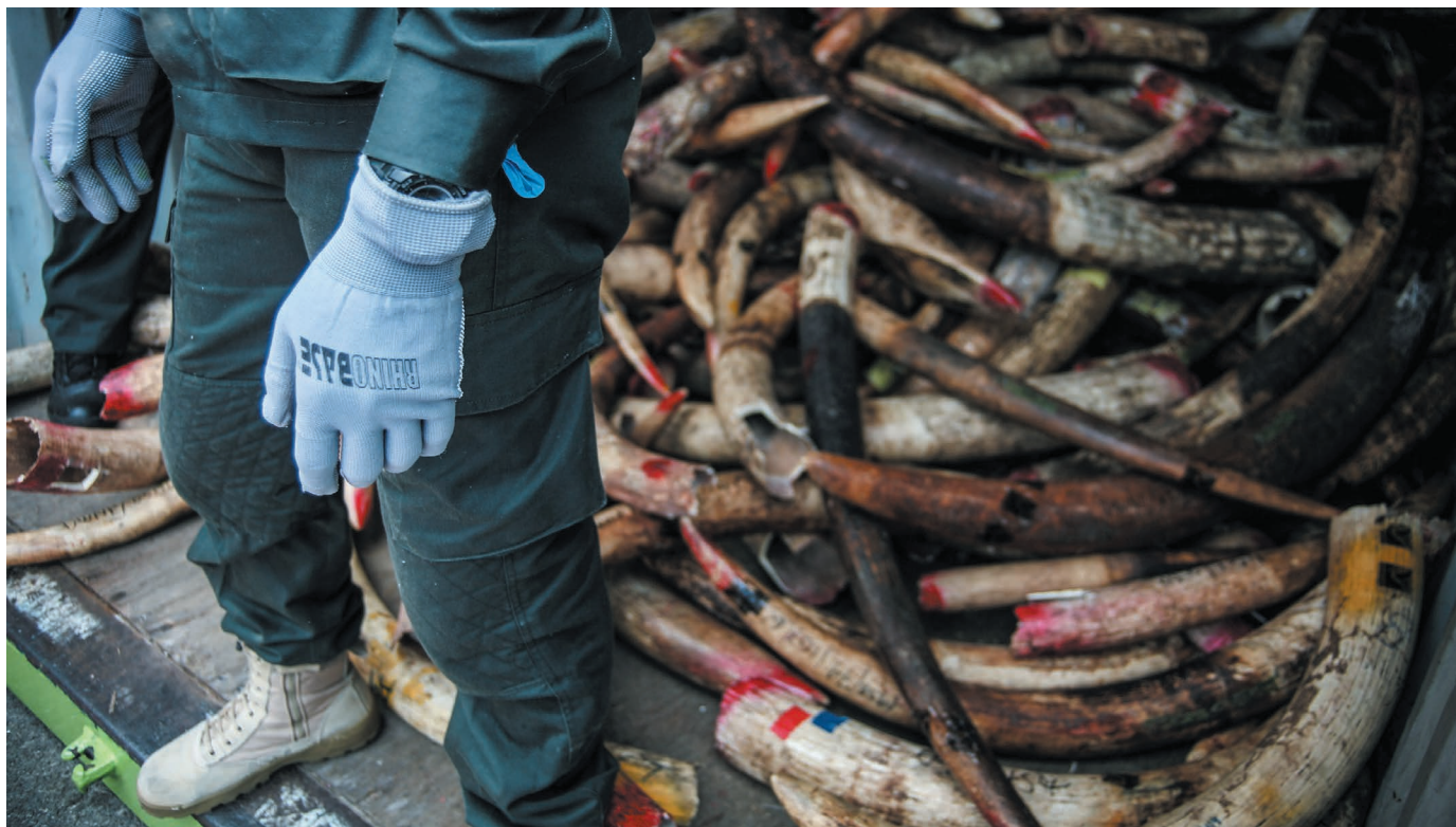
A container of seized African elephant tusks in Malaysia.