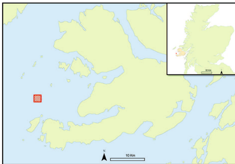
Figure 3 Area needed to grow enough seaweed to meet domestic gas requirements for homes on the Isle of Mull, West coast of Scotland, based on a production of 200 wet tonnes ha -1 .

aquaculture, fisheries, energy generation and shipping is required.