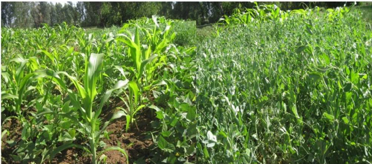
Figure 2. Picture partly depicted the experimental field.

Excluding boarder row plant height of 10 randomly selected tagged plants were measured per plot area of each experimental from the ground level to the initiation of tassel and for the second crops from the ground to leaf axils or flower initiations with linear meter (cm) during physiological maturity period and its average value was used for further analysis. Similarly, number of cobs or pods per plant was also counted and averaged from the 10 randomly selected plants. Number of seeds per cob or pod was also counted and averaged from cobs/pods of 10 randomly selected plants per plot. A different 10 randomly selected plants of each crop per plot were harvested at their 90% maturity and sun dried very well to measure their dry biomass with sensitive electrical balance in gram (g) and converted into hectare basis in kilo gram (kg). After measuring their dry biomass, randomly selected plants per plot were threshed manually and their grain yield was measured with sensitive balance in grams and converted into hectare basis to express in kg. Thousand seeds were also selected from grain yield of 10 selected plants and measured with sensitive balance to determine 1000 seeds weight which is expressed in gram. Both grain yield and 1000 seeds weight were adjusted at 12.5% for maize and 10.5% moisture content for all secondary crops (source Ethiopian seed enterprise).