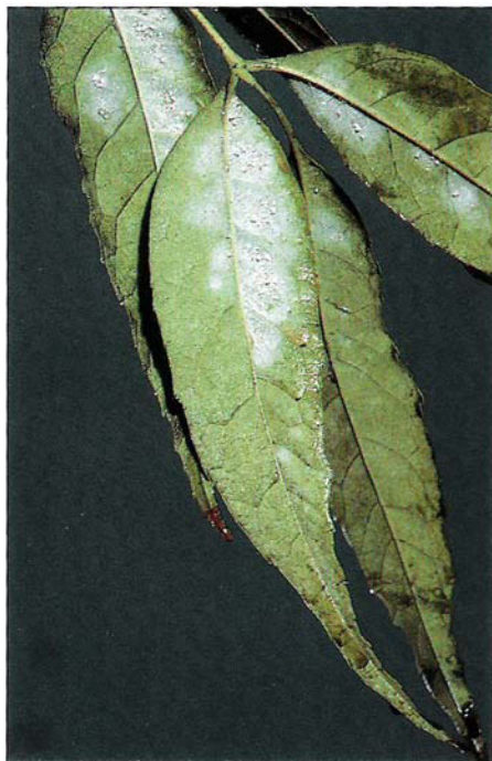
Heavy infestations on leaves such as ash (above) result in large amounts of honeydew, which fosters growth of sooty mold and drops on sidewalks and other surfaces (below). Both adults and nymphs also damage trees by sucking sap from the leaves.

Ash whitefly has spread over a large portion of California since the initial infestation was discovered in Los Angeles County in 1988. Populations have grown to high densities on a wide range of host plants, including ash, pear, apple, citrus, and other landscape and fruit trees. The best hope for control appears to be natural enemies: a parasitic wasp and a predatory beetle have been introduced and are being evaluated.