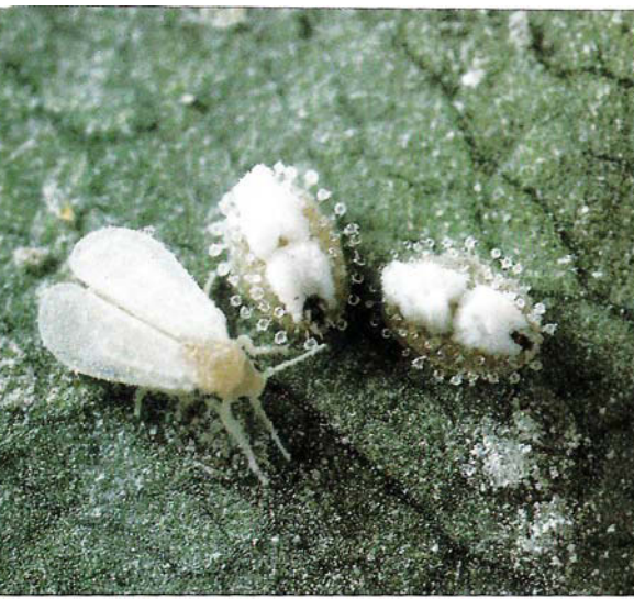
Ash whitefly adult with two fourth-instar nymphs, or "pupae." Beads of wax on the nymphs occur at the ends of 40 or 50 tiny siphons, or tubes, arising from the dorsal surface.