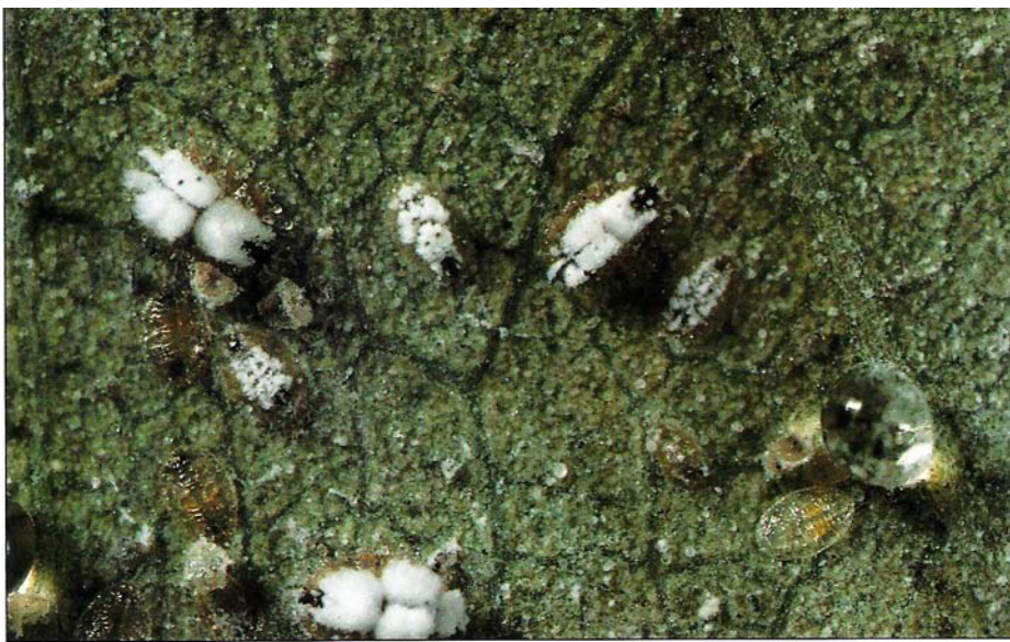
Ash whitefly nymphs produce wax in a central strip on their dorsal surface. This is more pronounced in older (larger) nymphs, and nearly lacking in younger, semi-transparent nymphs.

1). In California, the ash whitefly's ability to feed on many plants and its extraordinary population growth have resulted in reports of many new host plants, some in families not previously known to host this species (table 1). In addition, different hosts are more heavily infested in some seasons than in others. During the summer and autumn, dominant hosts include ash, pomegranate, pear, and apple. Populations grow to enormous densities on these hosts, often covering 100% of the available foliage and producing substantial amounts of honeydew and sooty molds. In the autumn, as the summer hosts become dormant, populations move to other plants including citrus and the native toyon or Christmas berry.