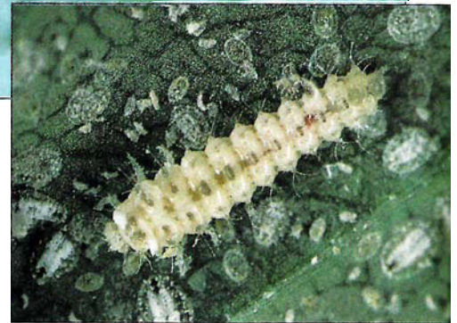
The tiny parasitic wasp Encarsia (above), which lays eggs inside older whitefly nymphs, is one of the introduced natural enemies being evaluated for biological control. Another is the predatory coccinellid beetle Clitostethus arcuatus , introduced from Israel; both the adult (above right) and larva (right) eat immature ash whiteflies.

Pesticide treatment is an option primarily against populations on nursery stock destined for shipment to noninfested areas. Several pesticides have been tested with varying results. None provided completely clean stock when applied to infested seedlings, and few provided even moderate population reduction for seven days. The general population in the environment rapidly reinfested treated material, and populations reached nontreated levels within a few days of treatment. Use of pesticides generally is not recommended for landscape trees for this reason. Mature landscape trees have withstood heavy infestations for two seasons without marked loss of vigor, although some defoliation has occurred.