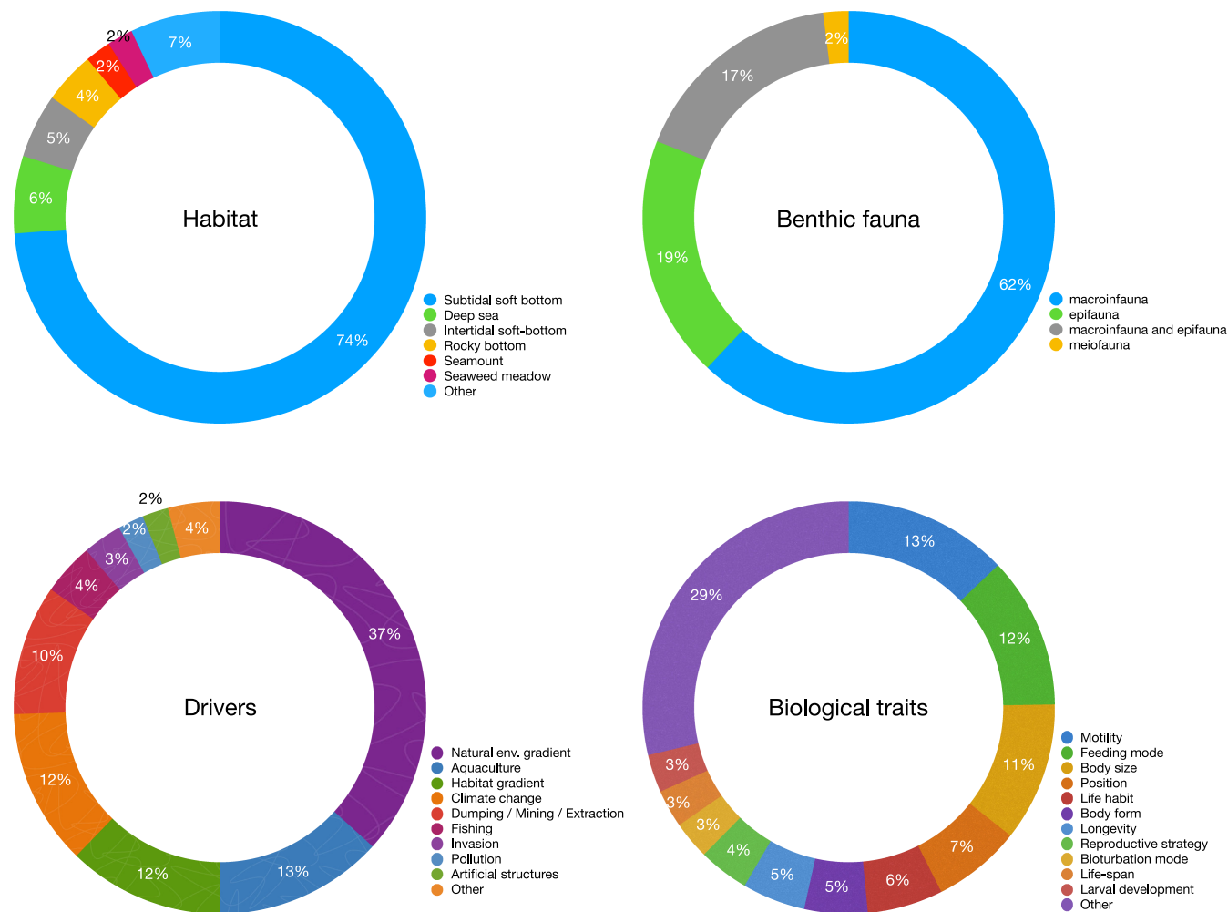
FIGURE 1 The literature on biological traits, as a summary of 90 published papers from 2003 to 2021 (Scopus literature database search in 25/12/2021), has widely covered marine habitats and benthic components, natural and anthropogenic drivers of change, and biological traits. The most commonly assessed drivers have been biotic and abiotic natural gradients, aquaculture, and climate change, whereas the most common traits have been the motility, feeding mode, body size, and environmental position

some dead ends and provide new paths (or revived old ones) to advance the field of functional benthic ecology.