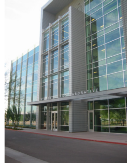
Fig. 1 The new Arizona Biomedical Collaborative-1 building on the Phoenix Biomedical Campus, housing the Arizona State University Department of Biomedical Informatics on the first two floors. The upper two floors are occupied by the Department of Biomedical Sciences of the University of Arizona College of Medicine-Phoenix in Partnership with Arizona State University (COM-PHX).

As mentioned, the PBC also is home to the Translational Genomics Research Institute. (TGen), a non-profit organi-