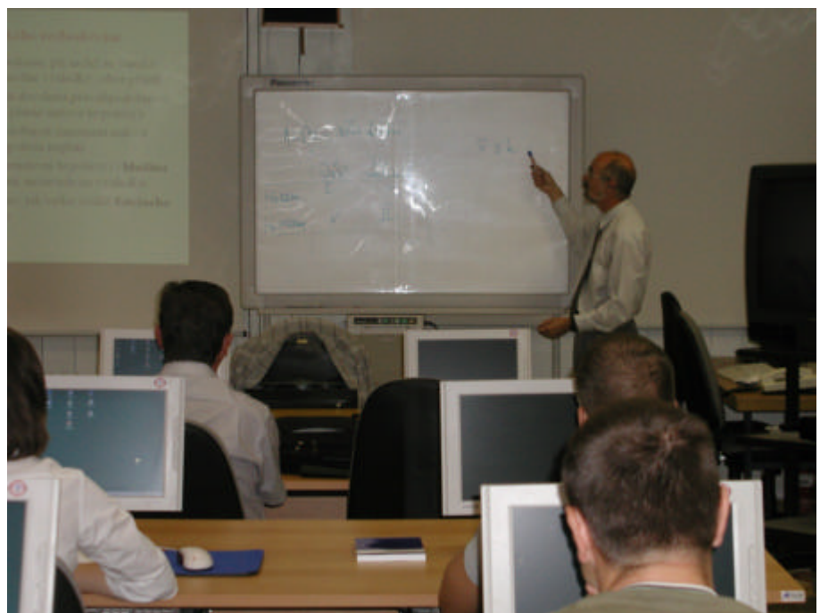
Fig. 1 EuroMISE course for doctoral students

tion and training, e.g. [8], [9], [10], [11]. Based on the experience in the European projects, the EuroMISE Center has started to develop two series of books in Czech in the fields of Biomedical Informatics and Biomedical Statistics. Printed versions of the books are issued by the Carolinum Printing House of Charles University in Prague; their electronic versions are available on the Internet [12], [13], [14], [15]. The first information on biomedical informatics doctoral studies and on the exploration of the electronic textbooks and other tools developed in the EuroMISE Center was presented in [16]. It seems that the Ph.D. studies in biomedical informatics are matching the recent research needs of the Czech Republic. They might help to accelerate the development of interdisciplinary biomedical research to the sound European level. The long-term effect of postgraduate doctoral education in the field of biomedical informatics results in the rapid increase of scientists that are needed in the Czech Republic to