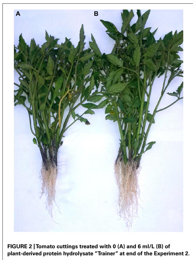
FIGURE 2 | Tomato cuttings treated with 0 (A) and 6 ml/L (B) of plant-derived protein hydrolysate “Trainer” at end of the Experiment 2.

the plant-derived protein hydrolysate “Trainer”. Similarly, other commercial products derived from the enzymatic hydrolysis of animal proteins containing a mixture of amino acids and peptides, have been reported to elicit a weak IAA-like activity (Ertani et al., 2009). The higher IAA-like activity of plant-derived protein hydrolysate “Trainer” could be explained by its tryptophan content (1.4%) that is the main precursor for IAA biosynthesis pathways in plants. Moreover, the biological action of peptides may also have contributed to the IAA-like activity of the plant-derived protein hydrolysate. Many secretory and non-secretory peptide signals are involved in various aspects of plant growth regulation including, root and callus growth, defense responses and meristem organization (Matsubayashi and Sakagami, 2006; Ertani et al., 2009).