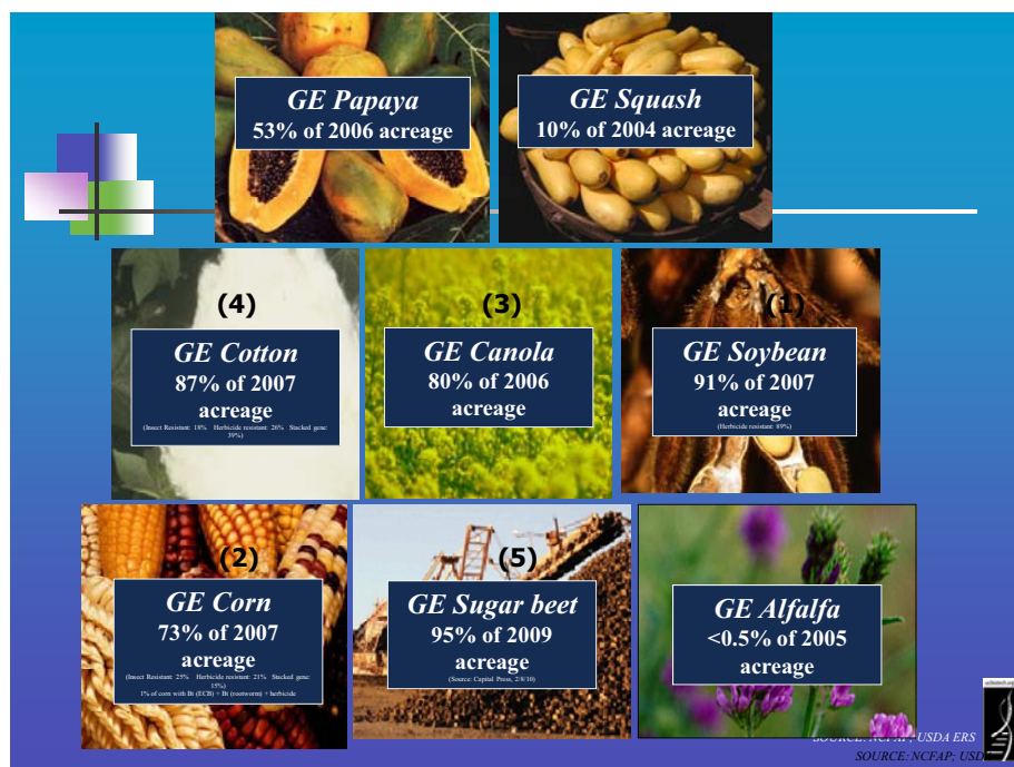
Fig. (3). Commercially marketed GM crops in the US: 1 (most selling) 5: least selling [26].