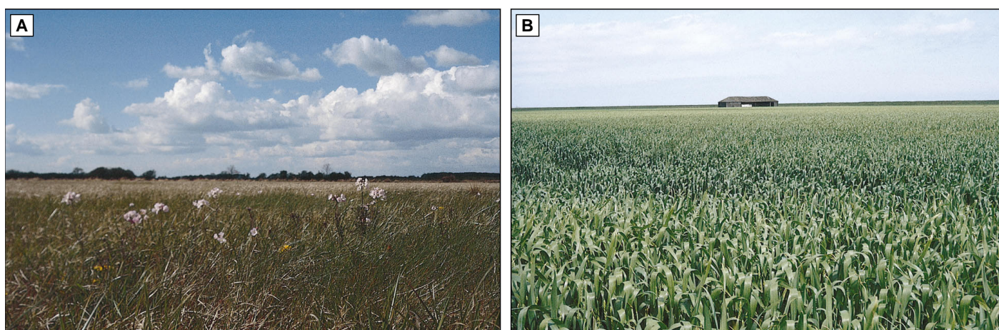
Fig. 2. Many human activities drastically simplify the species richness of ecosystems. (A) shows an ancient hay meadow on the Lower Derwent Ings in North Yorkshire, England. “Ing” is a Viking word meaning flooded meadow. The Ings flood every winter, remain damp in the summer, receive no fertilizer or pesticide inputs, and are cropped for hay and grazed in traditional land use practices that have their origins in Viking Britain. The resulting seminatural ecosystems are extremely rich in plants, insects, and birds. They are also very easily destroyed and drastically simplified (B) by draining, ploughing, the elimination of winter flooding, and conversion to arable agriculture. Similar changes in land use are severely altering the biological diversity of ecosystems all over the world.

Given the frequently strong effects of species composition and diversity on ecosystem processes seen in experimental studies, what can we expect in the future? Land use change currently has the largest effect on biodiversity (Fig. 2), but changes in atmospheric composition and climate will likely have increasing impacts. The current rapid rates of deforestation, urbanization, and overexploitation, whether through overgrazing or overfishing (61), strongly affect species composition and diversity. Areas in which there is substantial nitrogen deposition also exhibit reduced diversity (62).