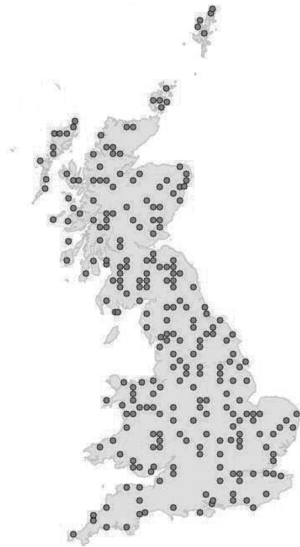
Figure 1. Map of Great Britain showing the location of the 238 1 km sample squares within which vegetation plots were recorded in 1978.

influence each other's resource consumption (Huston 1999). By using relatively small sampling plots (10–200 m 2 ) nested within each 1 km square, we ensure that estimates of \alpha -diversity and species composition target relatively homogenous stands sensitive to local processes of population sorting but where these translate into between-plot patterns within the regions defined by each biogeographically homogenous 1 km square.