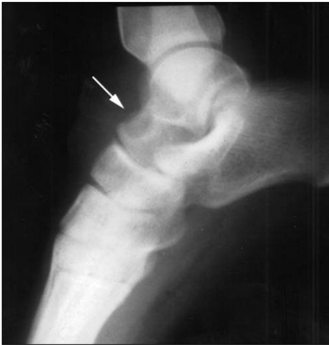
Figure 1) Radiograph of the left foot and ankle showing a sclerotic lesion in the anterior talus (arrow)