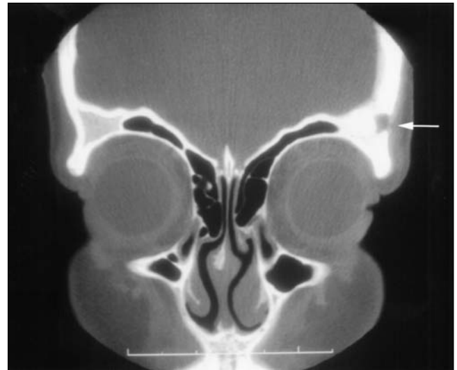
Figure 3) Coronal computed tomography scan showing a lytic lesion in the lateral aspect of the left supraorbital region (arrow)

At The Hospital for Sick Children, Toronto, Ontario, an x-ray of the left ankle showed a 1 cm lytic lesion in the talus with no periosteal reaction, as well as a joint effusion in the left ankle (Figure 1). Magnetic resonance imaging revealed extensive osteomyelitis of the talus, navicular and tibia. A sinus tract extended into the skin from the lesion in the talus (Figure 2). Synovial fluid and biopsies of the bone and synovium were negative by Gram, acid fast and calcofluor stains, but on culture they yielded a white, fluffy filamentous fungus identified as Blastomyces dermatitidis . The patient recalled having had a painful, firm swelling at the