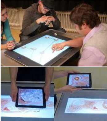
Figure 3: Examples of Blended Interaction from [8,10].

and inspire laymen, who prefer to learn about future technologies from narrations instead of from purely technical publications. Our workshop aims at creating a unified vision of Blended Interaction based on the individual contributions and experiences of the workshop attendees. This vision will be developed in highly interactive project groups and prototyped using simple non-digital materials, to be summarized and published to the HCI community in a shareable format (e.g., web page, YouTube video) after the workshop. The envisioning process will be guided by the principle of thoughtfully blending advantages of the physical and digital world. To ensure that our vision is credible and not science-fiction, it is developed together with the participating experts on technologies and technological feasibility and critically reflected in the light of cognitive theories of interaction. By this, we want to fuse the perspectives of user researchers, designers, and technologists, primarily to achieve a more realistic vision, but also to transfer knowledge between the different communities.