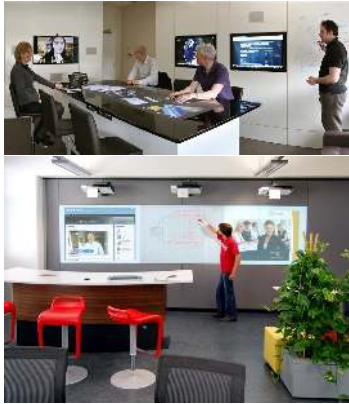
Figure 1: Examples of Blended Interaction from [1,2].