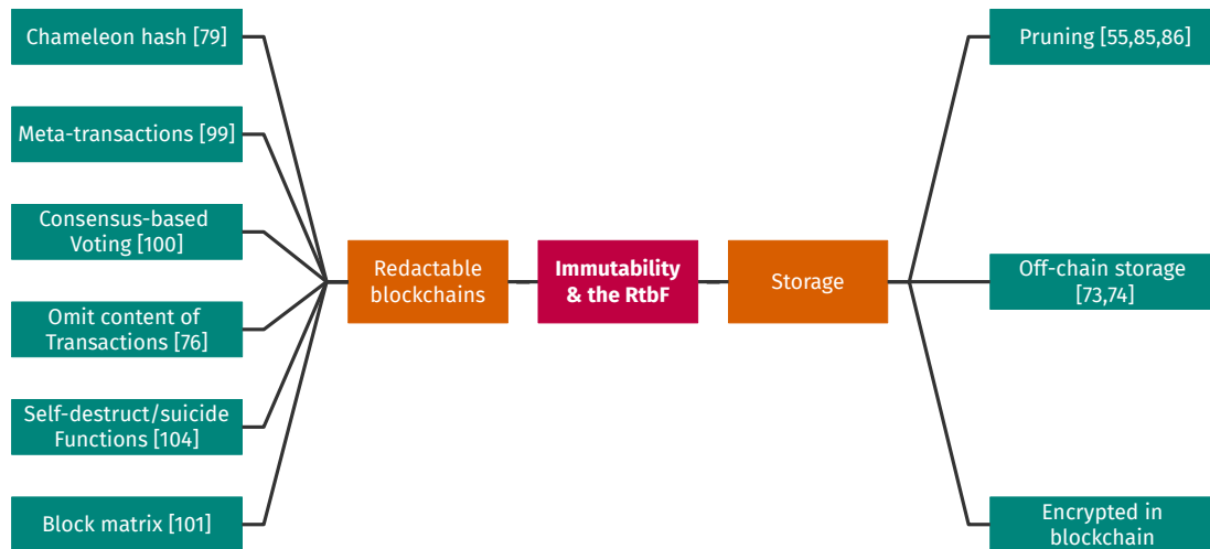
Fig. 2. An overview of solutions for balancing immutability and the Right to be Forgotten.

at a given point in time will remain in the blockchain. Bearing in mind that by using the stored hash alone the original content cannot be reconstructed, this workaround seems to resolve the blockchain's immutability collision with the RtbF rather elegantly. Indeed, off-chaining techniques so far are considered to be key tools in blockchain-based application engineering as they present significant benefits, such as reduced blockchain data storage requirements, and hence fewer scalability issues, and GDPR compliance [73], [55]. As a matter of fact, a recently conducted study [59] among experts concluded that blockchains could be indeed compliant with the privacy by design principles of the GDPR, and consequently with the RtbF, by employing these kind of off-chaining techniques. On the downside, however, these techniques move the responsibility of robust, distributed data storage to other protocols like the IPFS [75], while they introduce complexity and additional delays. Furthermore, they have been criticised for decreasing blockchains' security by introducing more attack vectors [76], [77]. But most importantly, these solutions do not avoid the burden of having to remove the hash pointers from the blockchain since hashed data are pseudonymous, not anonymous, and therefore need to be protected [65]. For instance, hashed data may reveal sensitive personal information either when combined with other available information or when they are subject to dictionary attacks.