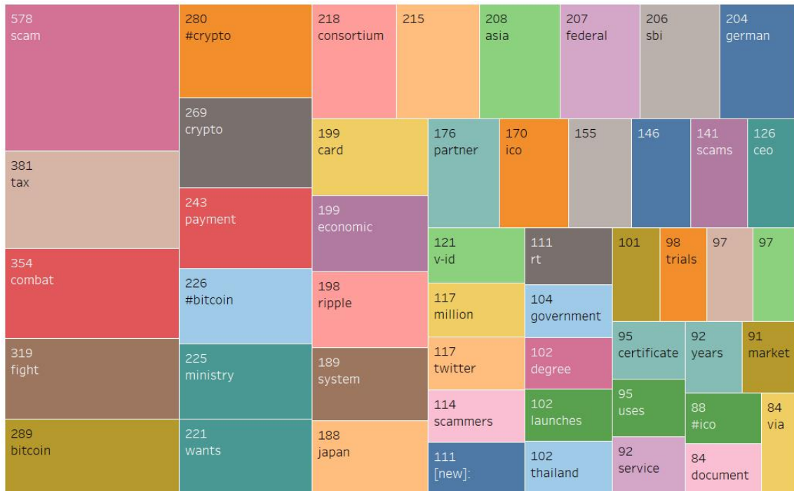
Figure 1. Top 50 words in Blockchain Fraud Discussion