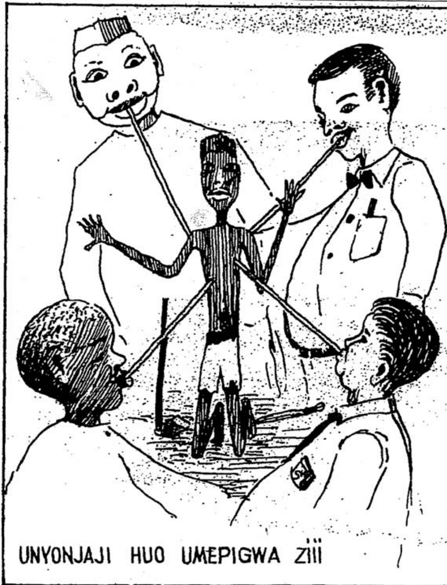
Fig. 1. Sucking blood. Cartoon from Ngurumo , 7 Feb. 1967.

the strength to farm with his hoe but also to strike the wanyonyaji still surrounding him. 37