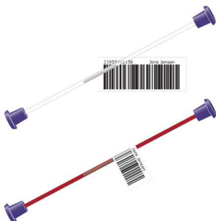
FIGURE 2. Recommended capillary blood gas sample labelling (source: Wennecke G, Dal Knudby M. Avoiding preanalytical errors – in capillary blood testing. Radiometer Medical Aps, Brønshøj, Denmark, 2009.)

Laboratory personnel are responsible for appropriate written instructions for sample collection according to the ISO 15189 standard (27). Arterial blood collection is performed by physicians (18) and nursing graduates (19) in healthcare institutions in Croatia. In order to ensure arterial sample quality and result reliability, laboratory personnel should inform ward personnel responsible for arterial blood collection of the required procedures.