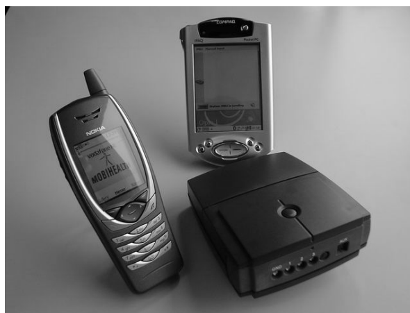
Figure 3 MobiHealth UMTS Trauma BAN

communication. The front-end also allows ZigBee [1] as an alternative intra-BAN communication technology.