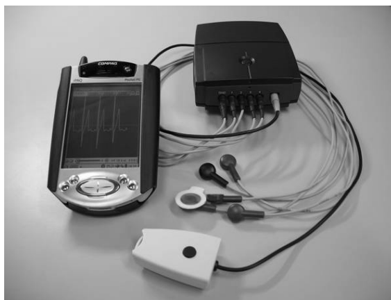
Figure 2 MobiHealth GPRS Pregnancy BAN

The BAN has been implemented using both front-end supported and self-supporting sensors. Fig. 2 shows the MobiHealth system with TMSI front-end sensors, configured for GPRS communication, while figure 3 shows the UMTS configurations (excluding the sensors). Both configurations use Bluetooth for intra-BAN