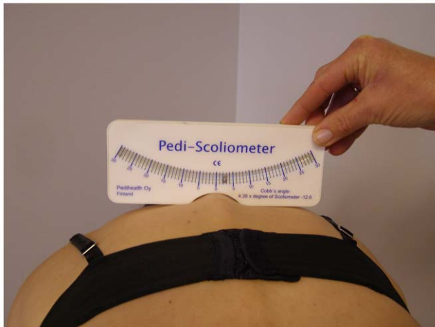
Figure 1. Measurement of deviations of the spine with scoliometry.