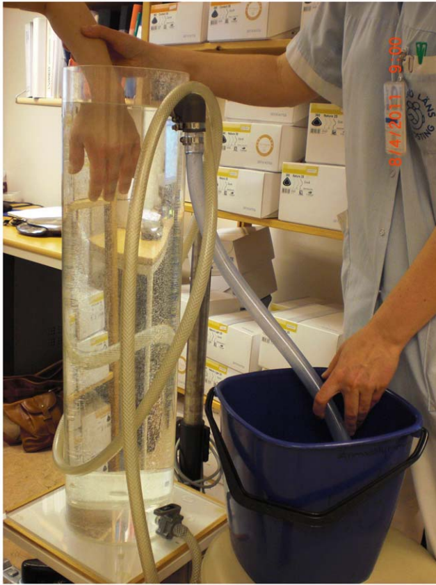
Figure 4. Water plethysmography, example of measuring volume at wrist level.