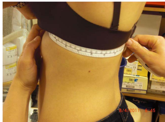
Figure 3. Measurement of thorax circumference.

The shortened Disabilities of the Arm, Shoulder and Hand questionnaire (QuickDASH), Swedish version. The QuickDASH is a validated 11-item version of the DASH that can be used in upper extremity musculoskeletal disorders with similar precision to the DASH [24,25]. Answers are ranked on a 5-point Likert scale ('no pain/difficulties at all', to 'a lot of pain/difficulties'). Two additional modules from the DASH, the 4-item