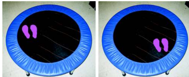
Figure 2. TrampleBeats. When the user lands on the surface of TrampleBeats different locations will trigger different tones or sounds.

Our design space maps musical instruments along two axes: whole-body, physical activity and musical expertise. Traditional musical instruments (e.g. pianos or guitars) are designed for precise interaction; players usually require a high level of expertise with their instrument before they are able to play them well, while being very physically active. Newer, gesture-based, electronic musical instruments (e.g. the Yamaha Miburi [10] or Michel Waisvisz's The Hands [8]) are similar to traditional musical instruments in this respect, though different in the way that they create sound.