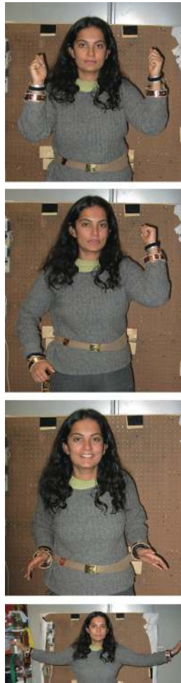
Figure 4. Ringalings. Different body positions trigger different sounds.

implementation features bracelets; however, we plan to incorporate extra accessories such as belts and anklets.