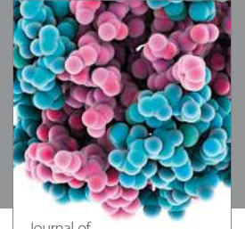
Journal of Diabetes Research