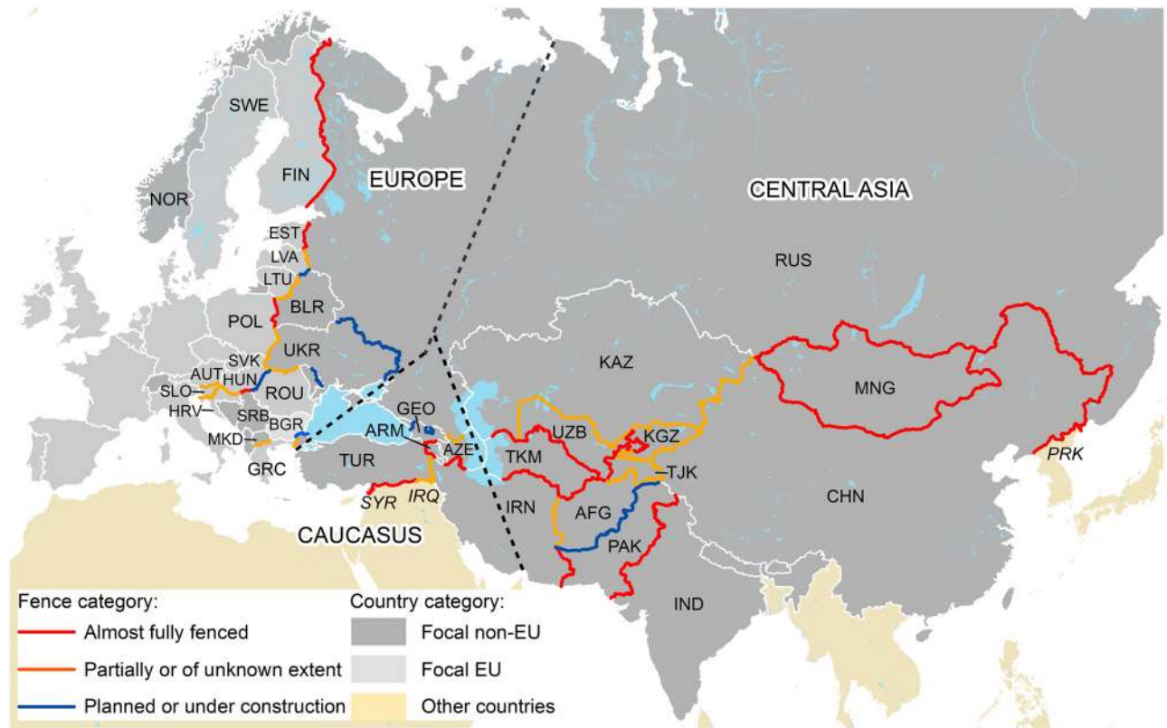
Fig 3. Extent of border security fencing along national borders in Europe and Central Asia.