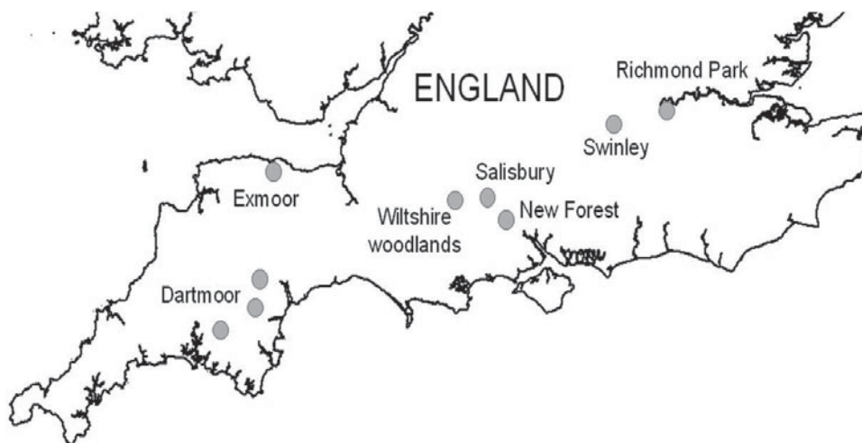
Fig. 1. Locations of field collections of questing Ixodes ricinus ticks in southern England.

Genbank with the use of Bionumerics software (Applied Maths NV, Belgium). A. phagocytophilum was not sequenced.