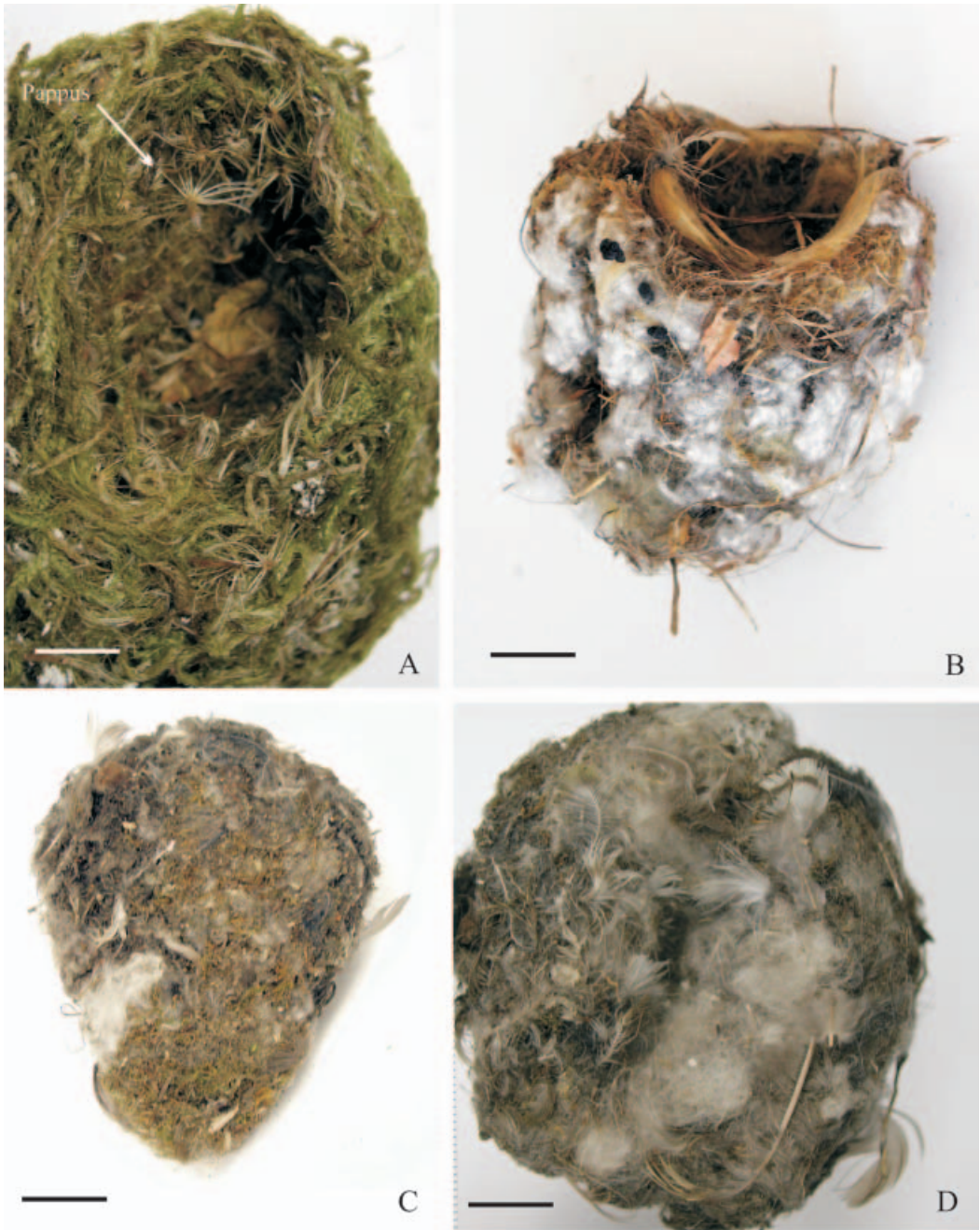
Figure 3. (a, b) Nests of the Green-backed Firecrown Sephanoides sephaniodes : (a) inner cup showing pappi as lining material; (b) nest collected from an urban site, with manufactured cotton in the outer layer. (c, d) Nest of White-sided Hillstar Oreotrochilus leucopleurus : (c) lateral view of nest covered by sheep's wool and feathers (reference in cm); (d) upper view, the cup opening is hardly noticeable due to soft materials present.