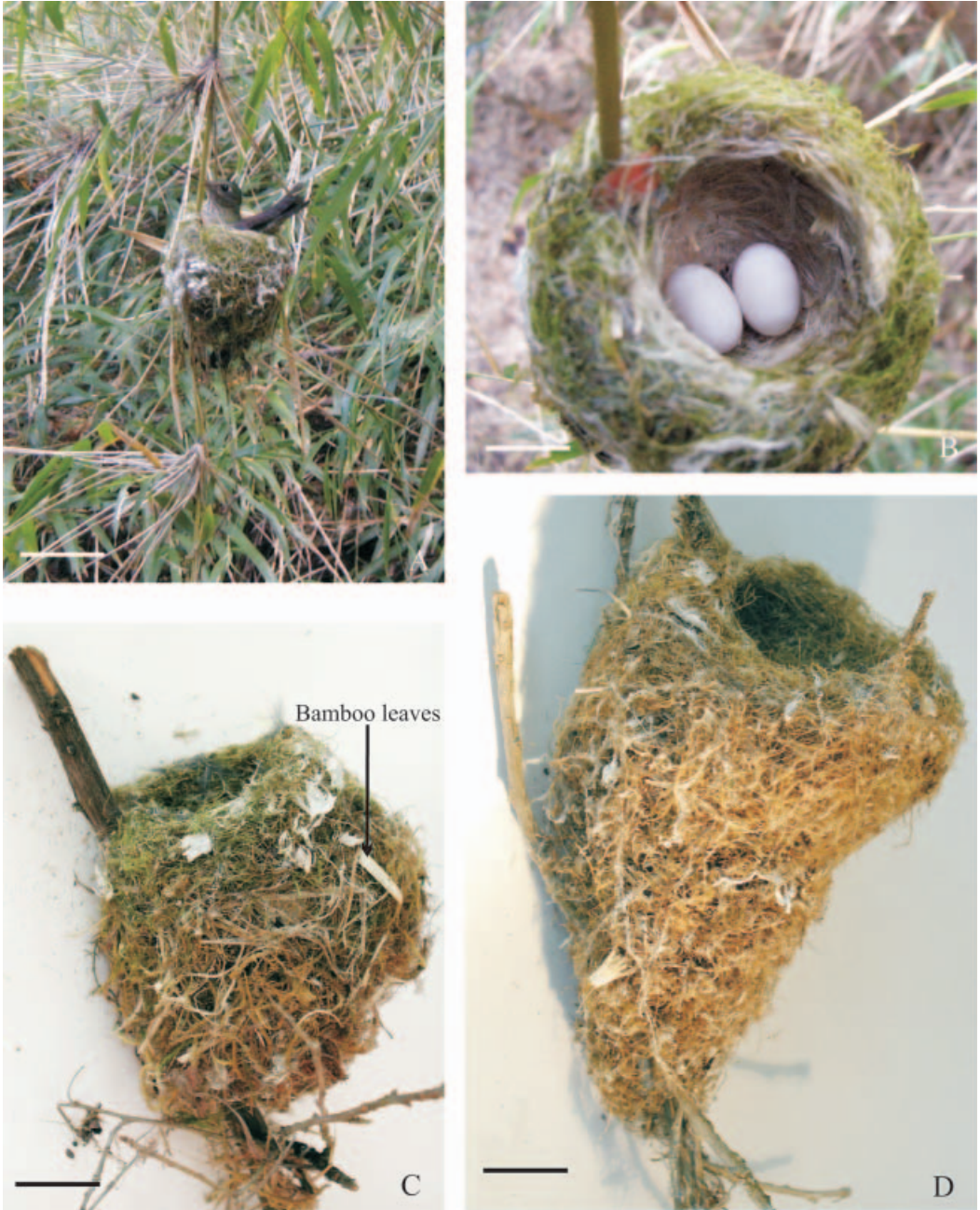
Figure 2. Nests of the Green-backed Firecrown Sephanoides sephaniodes . (a) Incubating female sitting in a nest camouflaged in a dense bamboo thicket; (b) upper view of an active nest; (c) nest showing lateral attachment to substrate, and pieces of bamboo leaves in the outer layer; (d) bulky nest built on a pre-existent cup.