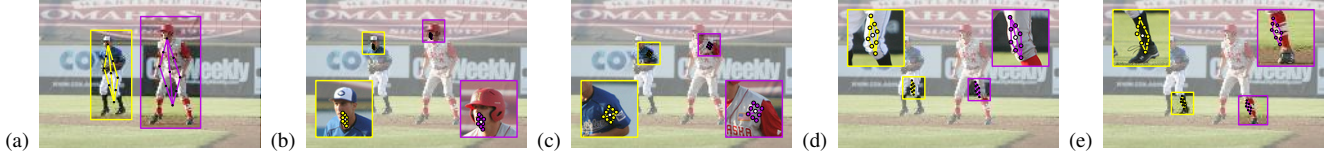
Figure 4. Illustrating adaptive activation. (a) Activated pixels from the single-branch regression. (b - e) Activated pixels for nose, left shoulder, left knee, and left ankle from the multi-branch regression (our approach) at the center pixel for each person. One can see that the proposed approach is able to activate the pixels around the keypoint. The illustrations are obtained using the backbone HRNet-W32.