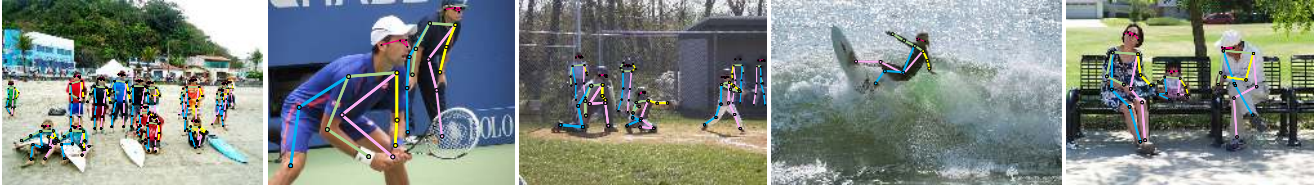
Figure 2. Multi-person pose estimation. The challenges include diverse person scales and orientations, various poses, etc. Example results are from our approach DEKR.

regression spread broadly and the regression quality is not satisfactory.