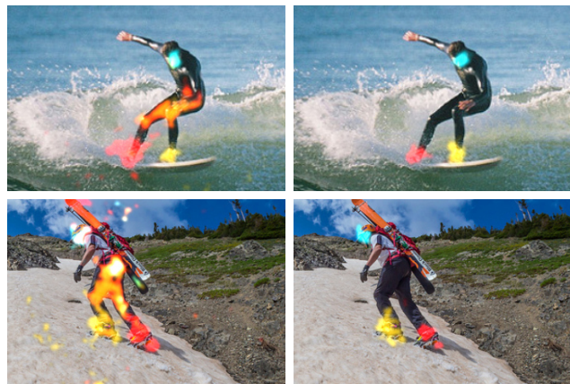
Figure 1. Illustration of the salient regions for regressing the keypoints. We take three keypoints, nose and two ankles, as an example for illustration clarity. Left: baseline. Right: our approach DEKR. It can be seen that our approach is able to focus on the keypoint regions. The salient regions are generated using the tool [46].

There are two main paradigms: top-down and bottom-up. The top-down paradigm first detects the person and then performs single-person pose estimation for each detected person. The bottom-up paradigm either directly regresses the keypoint positions belonging to the same person, or detects and groups the keypoints, such as affinity linking [7, 31], associative embedding [40], HGG [27] and HigherHRNet [11]. The top-down paradigm is more accurate but more costly due to an extra person detection process, and the bottom-up paradigm, the interest of this paper, is more efficient.