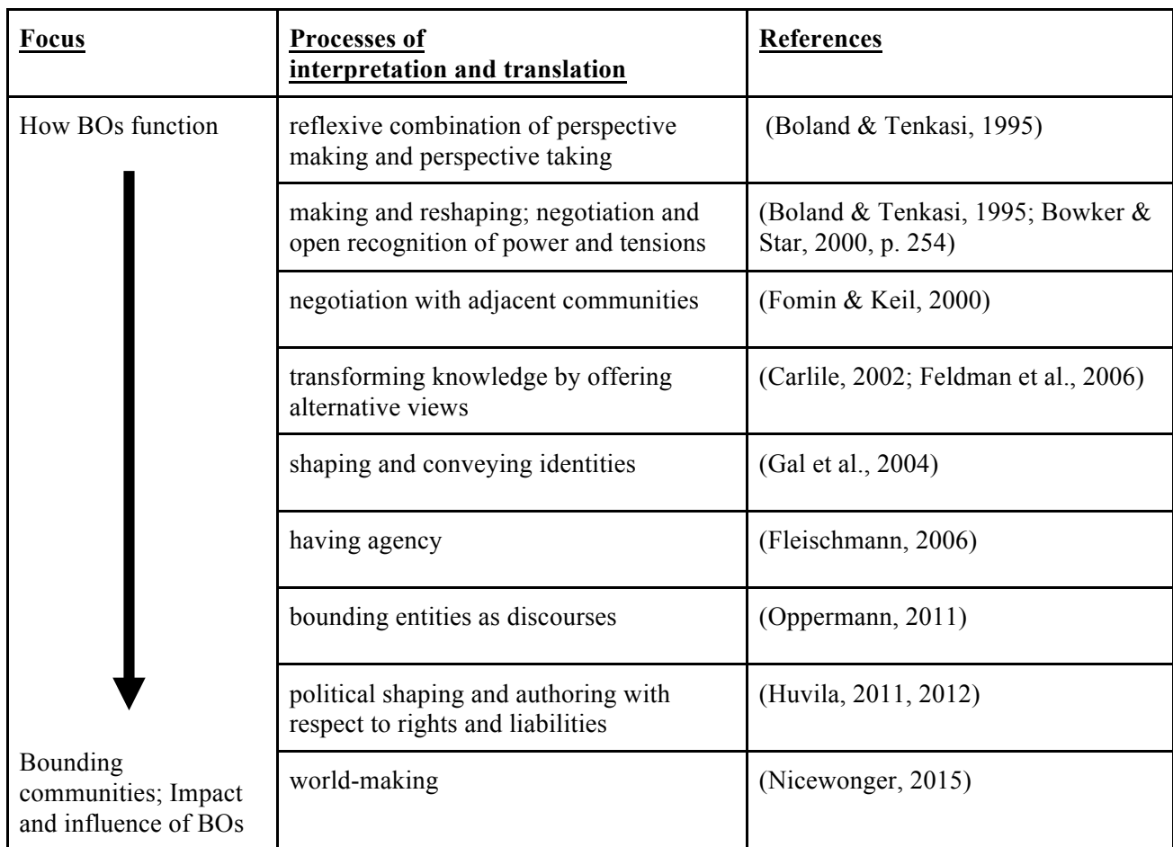
Table 3. Acts & processes performed by boundary objects in timeline

The diversification of domains and types of BOs identified and the kinds proposed suggest an emergent conceptual plurality. Researchers make claims on various aspects of what things theorized as BOs actually do in the world. These claims are of particular interest to information disciplines and the things and processes studied. These texts suggest that the concept relates not only to objects and activities of translation, even if Star and Griesemer (1989) and later Star (2010) emphasise their role in the processes of interpretation and translation. We see a spectrum of theoretical extensions emerge as the concept is operationalized. Early discussions noted that acts of translation incorporate attempts to exercise control over other communities to accept the interpretation of one community (Brown and Duguid, 1996). What seems to evolve is a shift from the explication of processes of how BOs function within communities to a focus on identifying broader societal/social relationships. Some of these processes of interpretation and translation are outlined in a chronological order in Table 3.