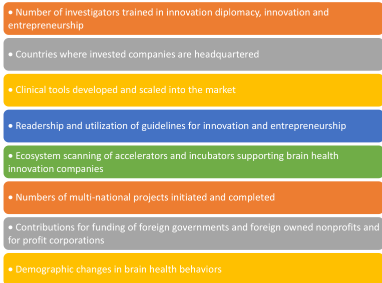
Figure 2. Potential Measurable Outcomes of Brain health INnovation Diplomacy-Related Activities.