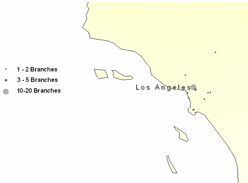
Figure 5 Extent of Branching by California Bank in 1929

Source: Annual Report of the Superintendent of Banks of the State of CA (various years), Rand McNally (various years), Comptroller of Currency Annual Report and Statements of Conditions (various years).