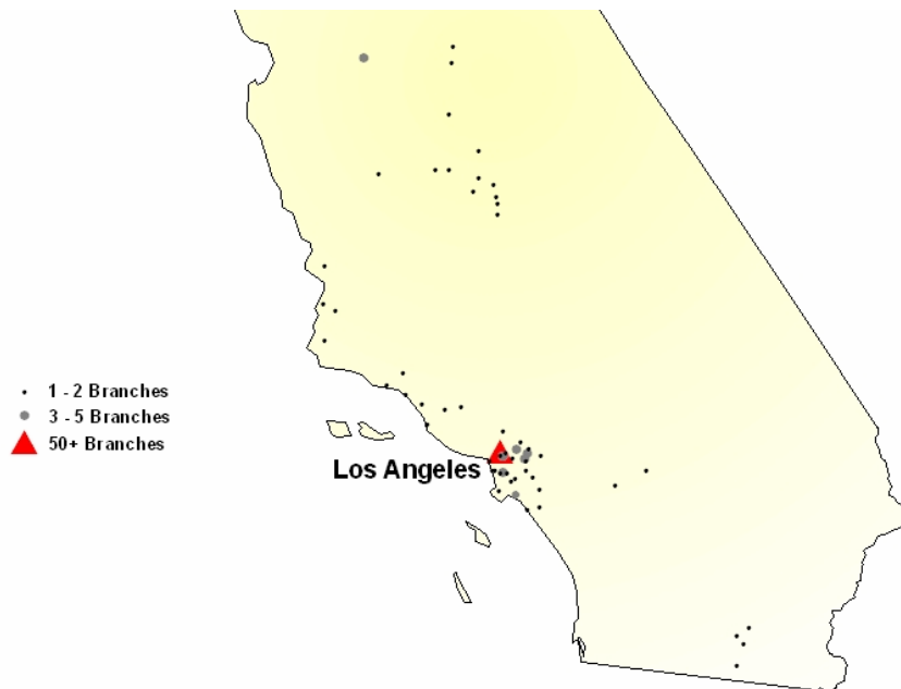
Figure 3 Extent of Branching by Security-First National Bank in 1929

Source: Annual Report of the Superintendent of Banks of the State of CA (various years), Rand McNally (various years), Comptroller of Currency Annual Report and Statements of Conditions (various years).