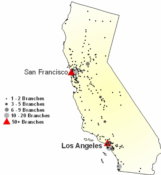
Figure 2 Extent of Branching by Bank of America in 1929

Source: Annual Report of the Superintendent of Banks of the State of California (various years), Rand McNally (various years), Comptroller of Currency Annual Report and Statements of Conditions (various years), and internal records of the Bank of America.