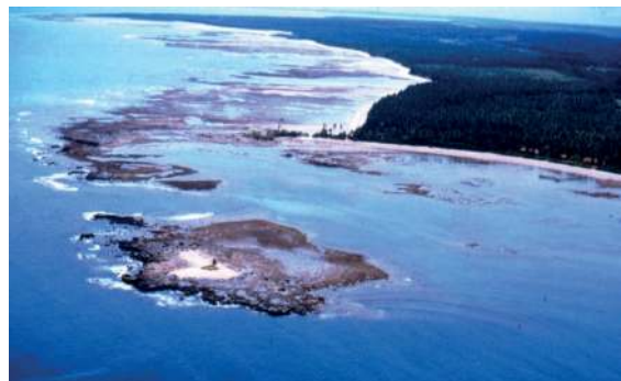
Figure 7. Aerial photograph of the shallow fringing reefs of Tinaré Island on the eastern coast of Brazil.

The area of Cabralia/Porto-Seguro is characterized by the presence of bank reefs of various shapes and dimensions in water no deeper than 20 m, running mostly parallel to the coastline (COSTA JR et al., 2006) (Figure 8). The elongated reefs may have grown on