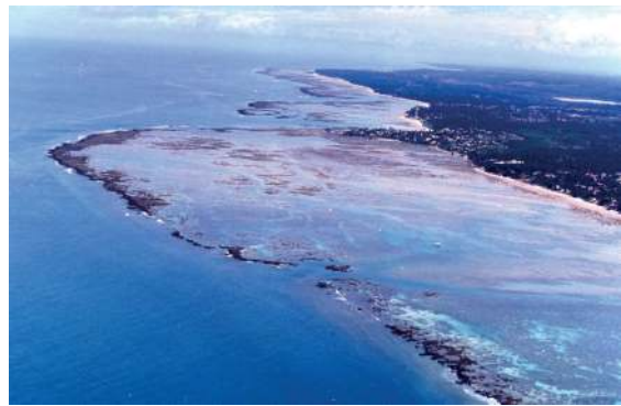
Figure 6. Aerial photograph of the Pinaunas fringing reef bordering the Itaparica Island shore at the entrance of Todos os Santos Bay, in Eastern Brazil.