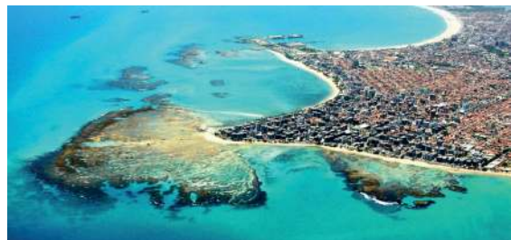
Figure 3. Aerial photograph of the Ponta Verde reef attached to the coast of the State of Alagoas on the northeastern coast of Brazil.