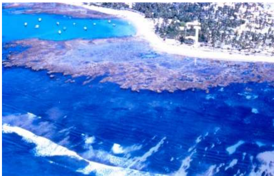
Figure 4. Aerial photograph of the Praia do Forte reef along the coast of the State of Bahia, in Eastern Brazil.