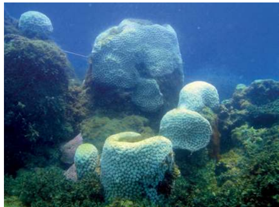
Figure 13. Photograph of bleached corals along the eastern coast of Brazil during the 2010 El Niño event.

or that of 2005, but all of the corals recovered after the sea water temperature returned to its normal values (OLIVEIRA et al., 2007; LEÃO et al., 2008, 2009; KRUG et al., 2012, 2013). In 2010, the high sea surface temperatures that were recorded in several parts of the world as causing coral bleaching were also recorded in the Brazilian reef areas. In the Atol das Rocas and Fernando de Noronha Archipelago, the temperature anomaly reached 1.67°C above average at the reef sites (FERREIRA et al., 2013). Along the coast of the state of Ceará, the first bleaching event recorded affected the corals Siderastrea stellata and Favia gravida and the zoanthid Zoanthus sociatus in an intertidal beachrock reef during the period of high sea surface temperatures (30°C to 32°C) for four to seven weeks (SOARES; RABELO, 2014). In the eastern region, severe coral bleaching affected the reef areas along the coast of the state of Bahia when thermal anomalies of up to 1°C were recorded (MIRANDA et al., 2013, KIKUCHI et al., 2013) (Figure 13).