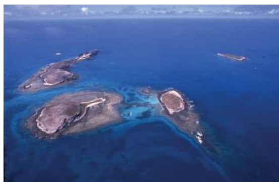
Figure 10. Aerial photograph of shallow fringing reefs surrounding the islands of the Abrolhos Archipelago in the southern portion of the state of Bahia, in Eastern Brazil.

sinkhole-like depressions known as “buracas”. These reef structures are almost drowned reefs with low coral coverage. In the deep pinnacles, the coral Montastraea cavernosa dominates, and a sparse occurrence of Siderastrea spp., Agaricia spp., Porites spp., Madracis spp., Favia spp. and Scolymia spp., along with the black corals Cirripathes and Antipathes have been observed (MOURA et al., 2013; BASTOS et al., 2013).