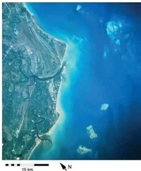
Figure 9. Satellite image illustrating the coral reefs of the coastal arc of Abrolhos.

Mesophotic reefs have been described across the mid and outer shelves of the Abrolhos Bank, at depths from 25 to 90 m. These reefs are structures described as submerged pinnacles, coalescent reefs 2-3 m high with