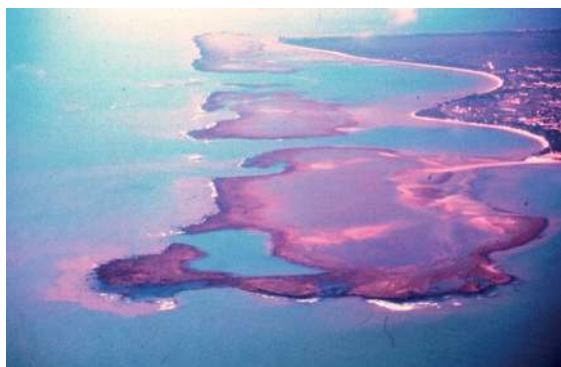
Figure 8. Aerial photograph of reefs of the Cabrália and Porto-Seguro region on the eastern coast of Brazil.

submerged strings of beach rocks (LABOREL, 1970). A few kilometers off the coast of Porto-Seguro, the Recife de Fora lies the reef habitat most visited by tourists in this entire region. Southward, there are the Itacolomis reefs, which are the beginning of the occurrence of the Brazilian giant “chapeirões” and isolated bank reefs separated from one another by deep irregular channels (CASTRO et al., 2006a; CRUZ et al., 2008).