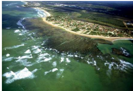
Figure 5. Aerial photograph of a reef attached to the coast of Itacimirim Beach on the coast of the State of Bahia, in Eastern Brazil.