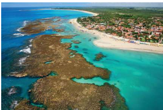
Figure 2. Aerial photograph of Porto de Galinhas coral reef on the coast of the State of Pernambuco, on the northeastern coast of Brazil.