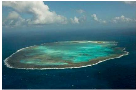
Figure 11. Satellite image of Atol das Rocas.