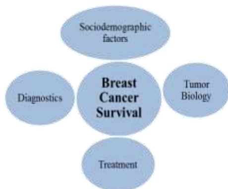
Figure 2: Overview of the factors that affect breast cancer survival.

Breast cancer is commonly treated by various combinations of surgery, chemotherapy, radiation therapy, hormone therapy and targeted therapy via a multimodality approach. Selection of therapy is influenced by clinical and pathologic features that could predict their response to these therapies (Table 2). In the developed countries, breast cancer is treated using evidence-based recommendatory treatment schemes. 37 Treatment plan is individually devised for each patient with respect to the clinical manifestations, the extent of the process, and the morphology of the tumor. Hormone receptor status is an important prognostic and therapeutic tool in breast cancer. 43-46