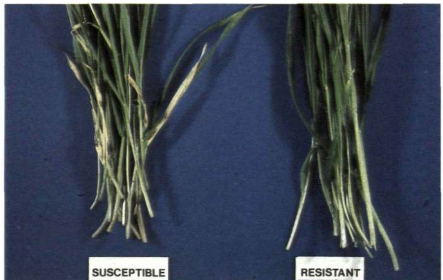
Two barley varieties grown in pots, one with resistance to net blotch

disease. Since Clipper barley has been grown, damage from net blotch has been less severe as Clipper is resistant.