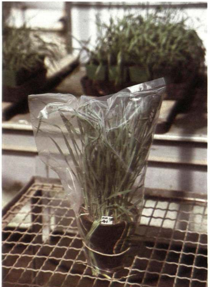
Plants are finally covered with a wet plastic bag to raise the humidity for 48 hours. This allows the disease spores to germinate and if the plant is susceptible, to start an infection