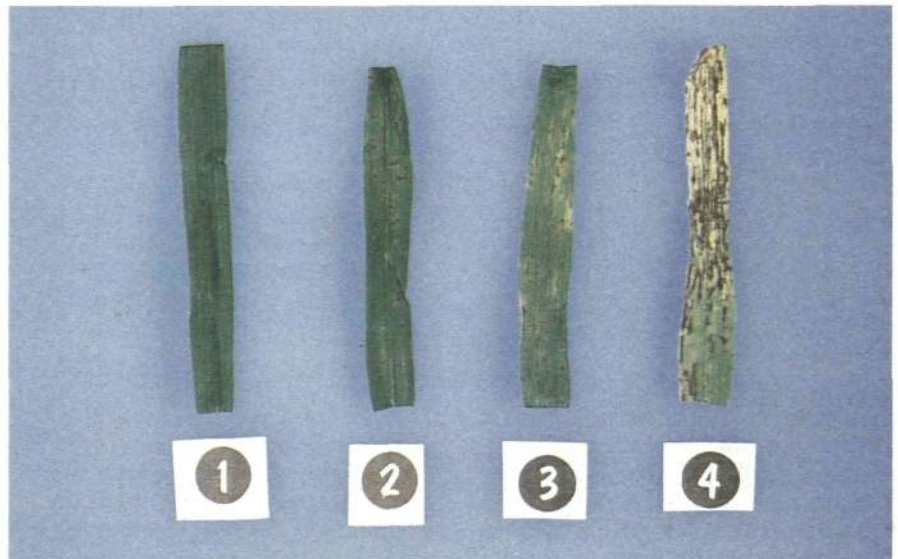
A range of reactions of barley to net blotch. The spots enlarge to give a netted appearance in severe cases

Areas worst affected by net blotch are the northern and central wheatbelt where the warmer conditions encourage growth of the