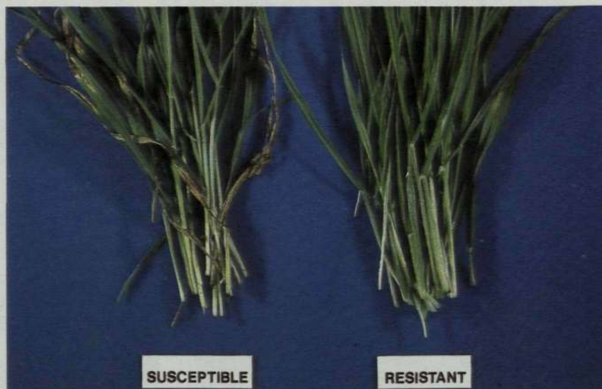
Two barley varieties grown in pots, one with resistance to scald

When a disease has many races, there is always the risk that a new race will develop and be able to infect the currently grown variety. Therefore to rely on resistant varieties to prevent outbreaks, new resistant varieties must be constantly released. For example this is necessary with wheat varieties