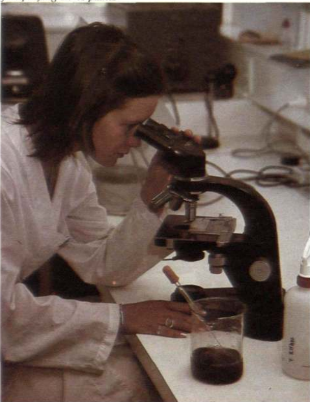
Spore concentration is then counted under the microscope to ensure that an equal amount of spores is deposited on each plant to be tested