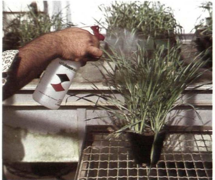
The suspension of disease spores is sprayed on the plant