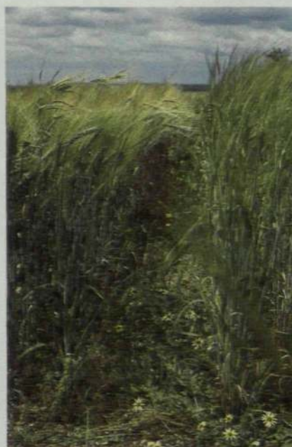
Scald susceptible barley growing next to a resistant type. Symptoms could be easily overlooked without a resistant variety for comparison.

resistant lines are being yield tested in the Department's plant breeding and variety trials.