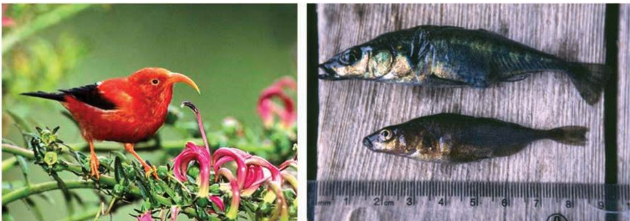
Figure 1. Adaptive radiation research is reliant on inferences. Classically, processes that led to observable patterns in adaptive radiations were drawn from studies of phenotypic and ecological differences among species interpreted in the light of their phylogenetic relationships, such as in the Hawaiian honeycreepers (left). At the other end of the spectrum, the processes that lead to diversification may be studied in clades of relatively few species (or forms) in groups presumed to represent the incipient early stages of an adaptive radiation, but which have not yet reached the ecological and morphological disparity of many established groups, such as in threespine sticklebacks (right).

There are a handful of other ways one might study the process of adaptive radiation. For example, the use of microbial systems to experimentally study questions about evolutionary diversification exploded at the start of the 21st century (Kassen 2009; Steenackers et al. 2016). Such experiments have several advantages over most model adaptive radiations: small organism size and fast rates of reproduction mean that studies can include large sample sizes, span many generations, and comprise multiple replicates (Jessup et al. 2004; Collins 2011). Replicated adaptive radiations among closely related lineages—in other words, independent radiations that have produced very similar outcomes in terms of the diversity of different species present within each radiation and paralleled across radiations—are rare in nature (Losos 2010), representing a classic problem in drawing generalizations across groups; microbial experiments provide an opportunity to overcome this. Microbial