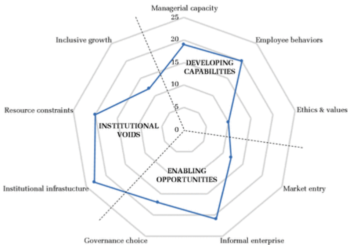
FIGURE 3: Overview of Articles