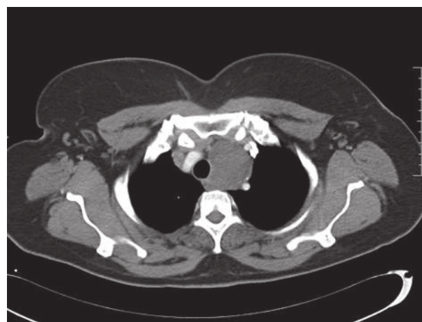
Computed tomogram showing the lower lateral cervical cyst extending to the mediastinum.