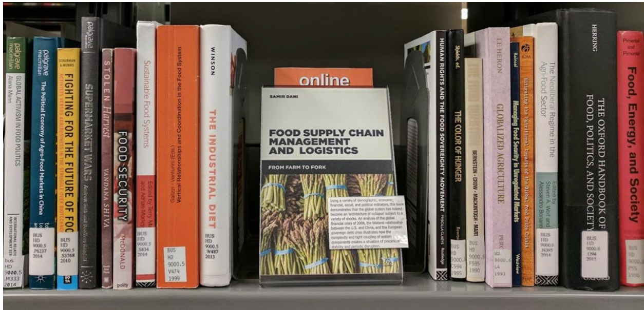
Figure 1. Example ebook display item.