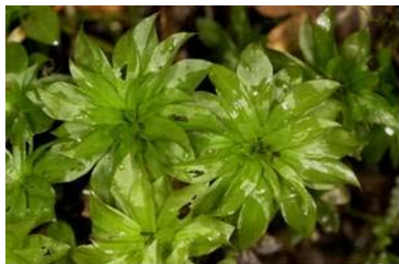
Figure 1: Rhodobryum sp. growing in natural habitat

Beginning with the statement, "Bryophytes grows where other plants can't." It is difficult to control because they will grow in extreme situations where vascular plants including turf grasses cannot. In bryophytes such studies are scarce. They form an important part of the Himalayan scenario; the percentage of occurrence of these small creatures in India is quite higher than that of any other plant group by about 27.5% of world mosses 1 . These are the largest group of land plants, which number about 25,000 different species and have wide distribution. As mentioned by several workers that Indian Himalayas are rich in bryoflora and India is one of the nation of South Asia and with in the country which is known as treasure house of bryophytes. These are primitive plants that have changed little over the course of history. Fossil records date the appearance of bryophytes 350 million years ago 2 . They are believed to have originated from filamentous (thread-like) green algae. Most are found in areas, which are humid and damp with a cold to moderately warm climate (Figure 1).