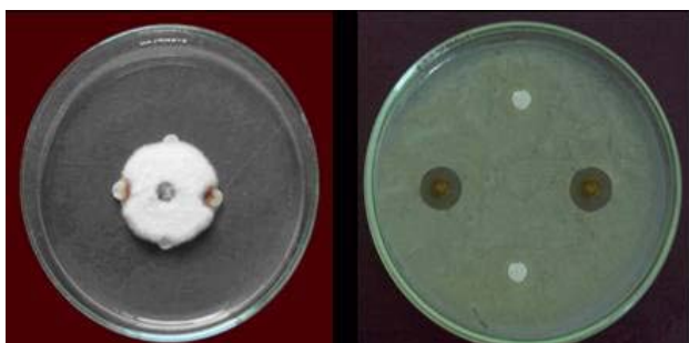
Figure 4: Rhodobryum sp. showing bioactivity against Tilletia indica (fungus) and Xanthomonas oryzae (bacteria).

This group is least investigated among plants for bioactive molecules. Yet in nature they appear to be well protected against grazing and pathogens by their chemical constituents. Some bryophytes such as the bog-moss Sphagnum and Rhodobryum sp. have well known antibiotic properties (Figure 4). Because of its absorbent and antiseptic properties it was used for dressing during World War I to make pillows for resting of wounded members for soldiers transported to hospitals from battlefields. Irish moss is a very useful herb as it has high content of nutrients. It contains vitamins A, D, E, F, and K. It has high content of iodine, calcium and sodium, which contributes in glandular system. It has high mucilage content, which makes it soothing to inflamed tissues and lungs and kidney problems 57 . Irish moss has been used externally to soften skin and prevent wrinkles. It purifies and strengthens the cellular structure and vital fluids of the system.