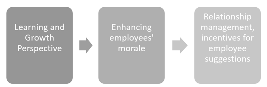
Figure 2. Learning and growth perspective.

In summary, Figure 2 shows the maximum objectives of this same perspective, as explained by Kaplan and Norton (1996b) [58].