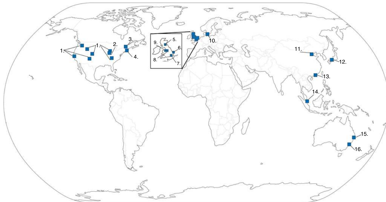
Fig. 2 Map of the Global Biofoundry Alliance. Map of the world showing the geographical locations of founding members of the Global Biofoundry Alliance with each biofoundry numbered. (1) DOE Agile BioFoundry (pending) located across Emeryville, CA, Richland, WA, Golden, CO, Lemont, IL, Los Alamos, NM, Oak Ridge, TN, and Idaho Falls, ID sites; (2) Illinois Biological Foundry for Advanced Biomanufacturing (iBioFAB), University of Illinois at Urbana-Champaign; (3) Concordia Genome Foundry, Concordia University Montreal; (4) DAMP lab, Boston University; (5) Edinburgh Genome Foundry, University of Edinburgh; (6) Earlham Institute, Norwich Research Park; (7) London DNA Foundry, Imperial College London; (8) SYNBIOCHEM, University of Manchester; (9) GeneMill University of Liverpool; (10) Novo Nordisk Foundation Center for Biosustainability, Technical University of Denmark; (11) Frontier Science Center for Synthetic Biology (MOE), Tianjin University; (12) Graduate School of Science, Technology and Innovation, Kobe University; (13) Shenzhen Institute of Synthetic Biology, Shenzhen Institutes of Advanced Technology, Chinese Academy of Sciences; (14) NUS Synthetic Biology for Clinical and Technological Innovation (SynCTI), National University of Singapore; (15) Australian Genome Foundry for Advanced Biomanufacturing (AusFAB), University of Queensland and (16) Australian Genome Foundry, Macquarie University. The Plotly.Py library was used to create the graphic and is open source under MIT license ( https://github.com/plotly/plotly.py/blob/master/LICENSE.txt )

To achieve these objectives, the GBA will provide coordination between Alliance members and promote collective action and sharing of pre-competitive infrastructure, open standards, protocols, best practices, bio-parts, and data where possible. This will also involve exploring standardized legal tools to reduce the transaction costs of sharing including the OpenMTA 7 . The GBA will also allow increased visibility about the role and importance of biofoundries by reporting on success stories and positive impacts. Other activities will involve the exchange of sustainable business models, as well as approaches to lowering transaction and operational costs and expanding user bases; and personnel exchanges, including developing teaching and training programs for researchers and users of biofoundry facilities. The GBA will actively and transparently engage a broad range of stakeholders including policy makers, industry, public funding and government agencies, as well as civil society to continually improve GBA activities and practices.