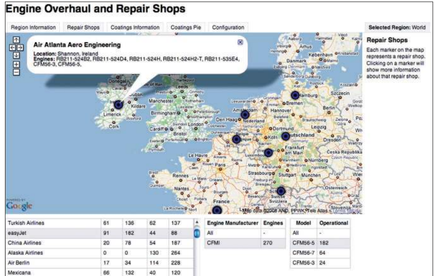
Figure 2. The Maintenance, Repair, and Overhaul (MRO) Expressway GUI. The Google map provides a straightforward interface to the information available through data in the RDF triple store.

As with AKTivePSI, MRO Expressway centers on a straightforward Google map in-