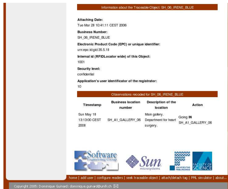
Figure 3: Locating a tagged object