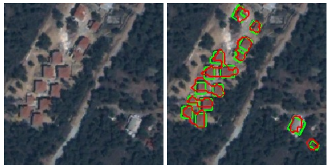
Fig. 1. Automated building detection from very high resolution multispectral data. The developed algorithm managed to detect efficiently scene’s buildings. The ground truth data are shown with a green color, while the detected buildings with red.

Very high resolution (VHR) satellite data are absolutely required for tackling the specific problem, while any spectral information more than the standard RGB enhance significantly the discrimination capabilities between the different man-made objects, soil, etc. Moreover, elevation data like Lidar, DSMs, etc can significantly ameliorate the detection pro-