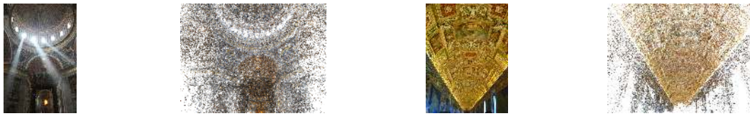
Pantheon: 1,032 images, 530,076 points