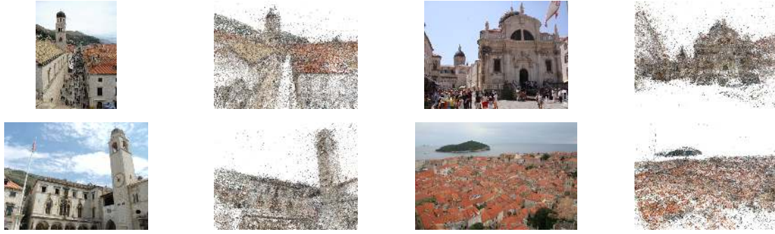
(a) Dubrovnik: Four different views and associated images from the largest connected component. Note that the component captures the entire old city, with both street-level and roof-top detail. The reconstruction consists of 4,585 images and 2,662,981 3D points with 11,839,682 observed features.