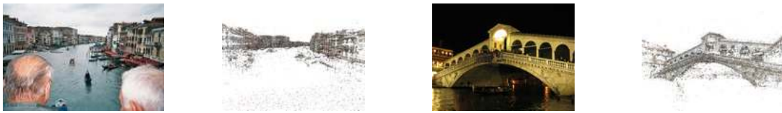
Grand Canal: 3,272 images, 561,389 points