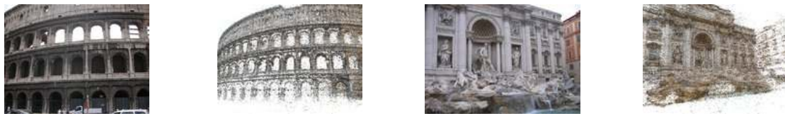
Colosseum: 2,097 images, 819,242 points