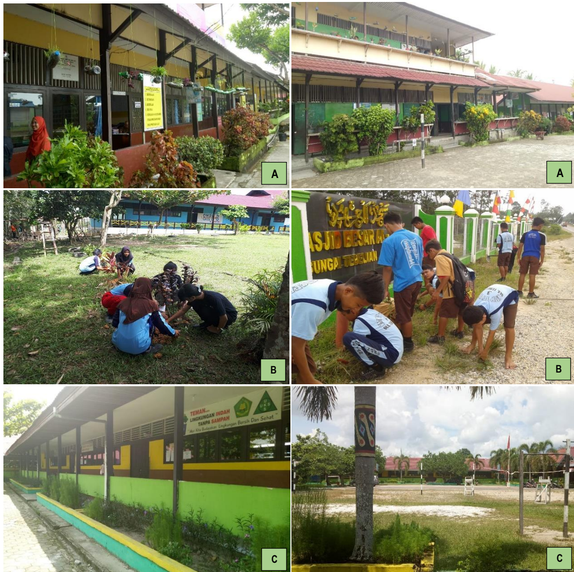
Figure 1. School environment and school activities in Adiwiyata school of Sintang district A) SDN 7 Sintang , B) SMPN 3 Sungai Tebelian , C) MTsN Sintang

Based on the field observation, overall, the Adiwiyata schools environment has shown good quality of existing school environmental. SDN 7 Sintang has much kind of ornamental plants which plants in front of school. They also used vertical garden to address the lack of land, as shown in (Figure 1A). SMPN 3 Sungai Tebelian has many shade plants in school environment which provide fresh air and good condition for learning. They also have mutual collaboration with surrounding neighbor to maintenance the clean environment, as shown in (Figure 1B). In MTsN Sintang , they have some Palm trees which used as shade and ornamental plants. They also plants other ornamental plants in school garden but not growth well because existence of infertile soil called Kerangas soil, as shown in (Figure 1C).