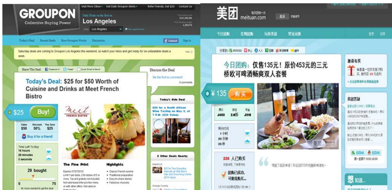
Fig. 1 Groupon.com in the US and Meituan.com in China